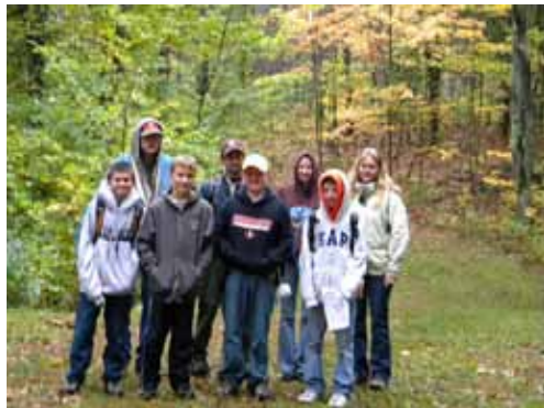
Iola Boy Scout Troop #631